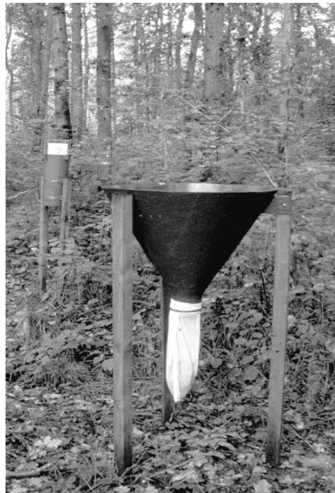
Solid funnel with bag